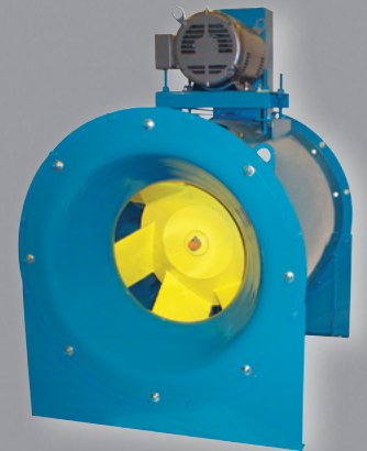
Model QSL/QSLR Mixed Flow Fans

Twin City Fan & Blower has the engineering and manufacturing capabilities to accommodate virtually every conceivable application. We have completed thousands of successful installations worldwide and have a proven track record for tackling the most technically complex and unique applications.